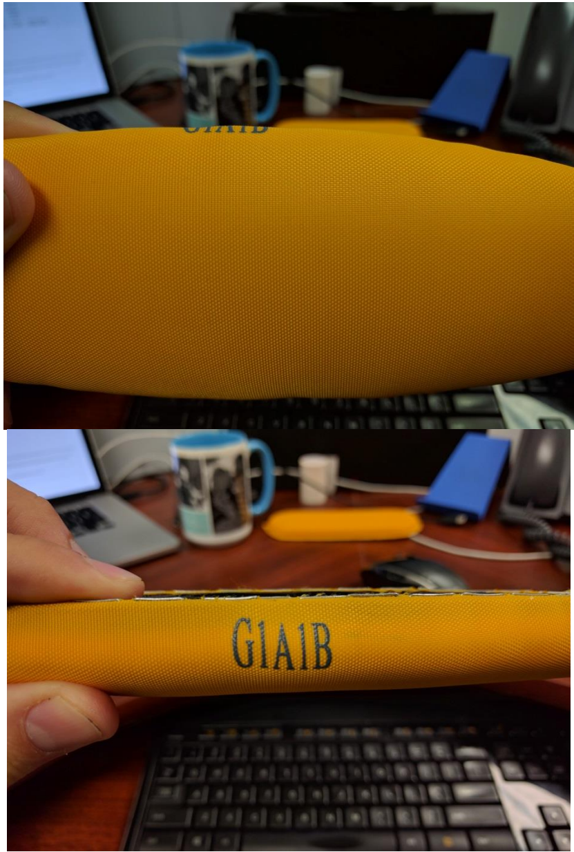
The Product Code is on the side of the pad stencilled on the fabric